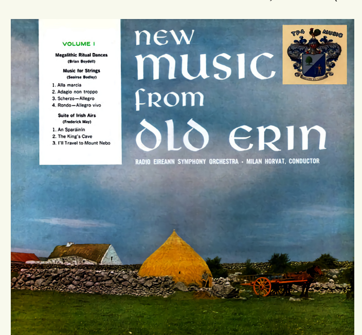
Figure 1. Sleeve of New Music from Old Erin, Volume I (Horvat 1956)

However, the MAI could not cope with the pace of change and was unable to restructure itself into a fully professional organisation, as requested by the Arts Council, and the relationship between the two deteriorated. Instead, the Arts Council embarked upon a number of its own initiatives to improve conditions for composers: the Arts Council set up the Composers' Commission Fund in 1980 (6 pieces were commissioned and performed in 1980 and 10 in 1981) and, in 1981, it established a joint administrative centre for the AIC and the Society of Irish Playwrights at Liberty Hall, Dublin with a grant of IR£9,500 and the Irish Contemporary Music Resource Centre with a grant of IR£19,500. The AIC, funded by the Arts Council, organised a composers in schools scheme and together with local authorities sponsored a summer school for young composers from 1983 which was directed by composer John Buckley.